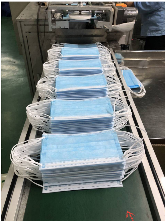
the production facility