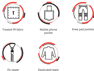
Treated FR fabric